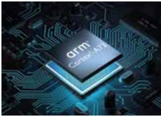
ARM Cortex A73 Dual Core + A53 Dual Core