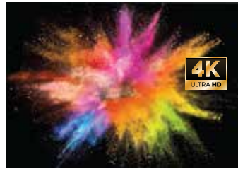
4K Resolution + 4K Annotation