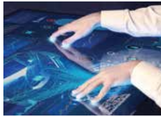
20 points Multi-touch