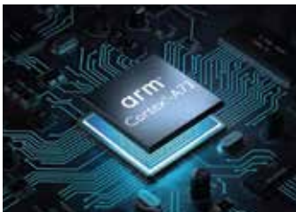
ARM Cortex A73 Dual Core + A53 Dual Core