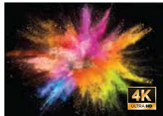
4K Resolution + 4K Annotation