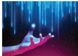
20 points Multi-touch