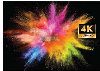
4K Resolution + 4K Annotation