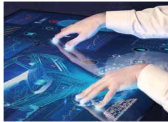
20 points Multi-touch