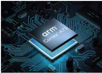
ARM Cortex A73 Dual Core + A53 Dual Core