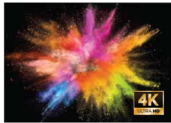
4K Resolution + 4K Annotation