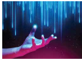
20 points Multi-touch