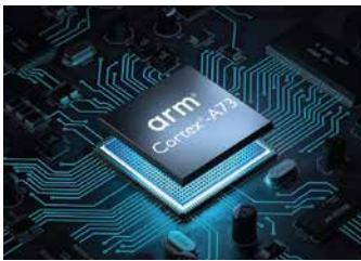
ARM Cortex A73 Dual Core + A53 Dual Core